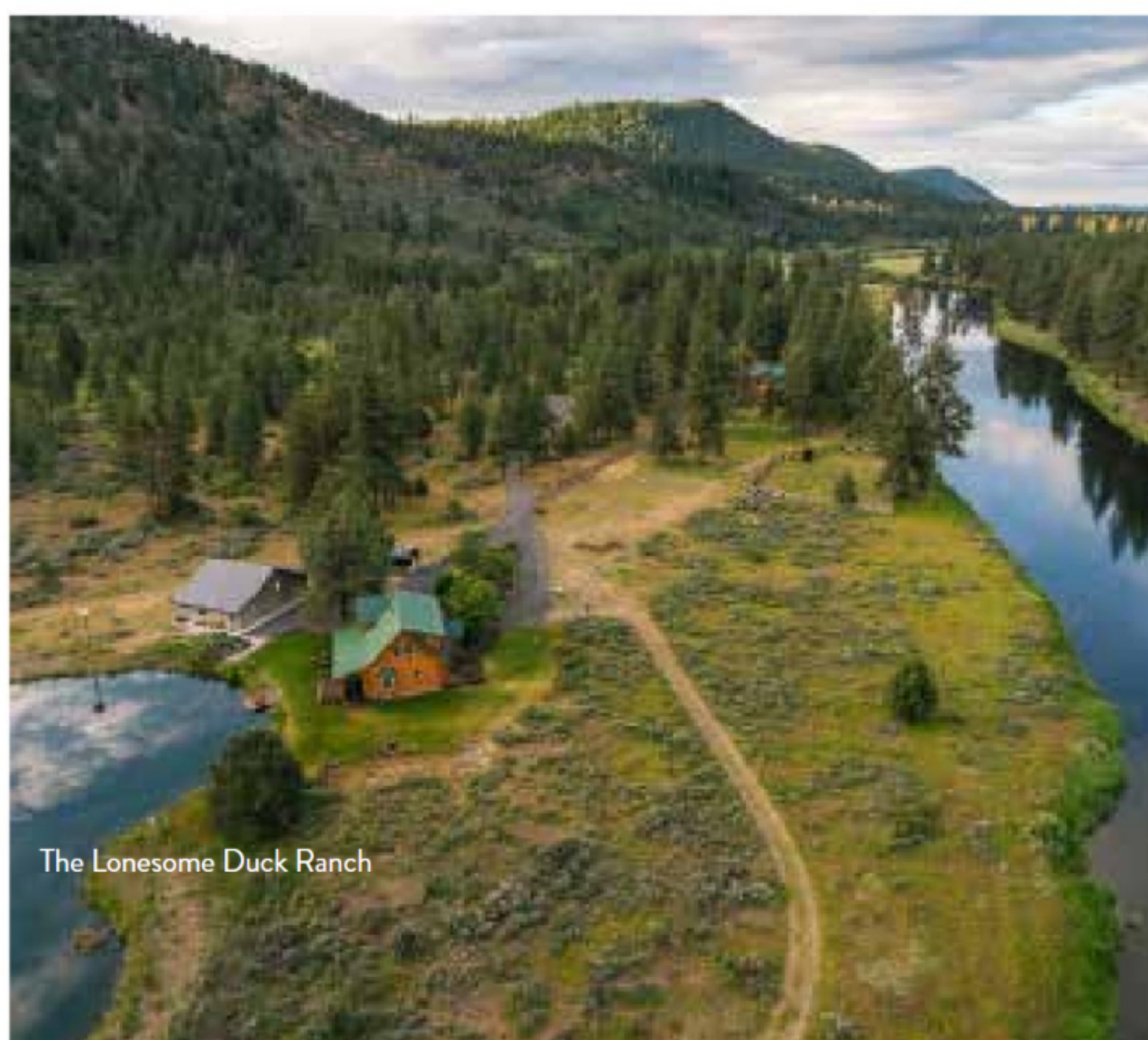
The Lonesome Duck Ranch