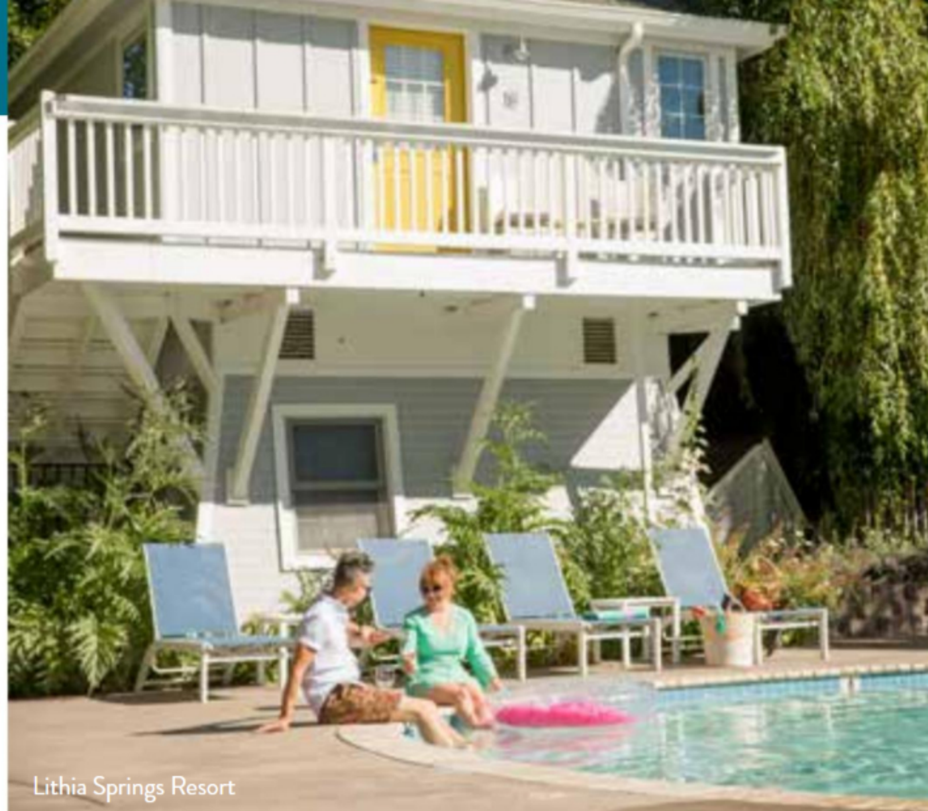
Lithia Springs Resort

Book a stay at one of Southern Oregon's many ranches for a rustic, outdoorsy ambiance. The Lonesome Duck Ranch offers fishing on the Williamson River and a peaceful, private environment. Running Y Ranch in Klamath Falls is a golf and spa resort with hotel or vacation rentals. The resort offers hiking and biking trails, ice skating, spa services and preferred tee times at the golf course. Willow-Witt Ranch in Ashland offers farm-stay accommodations and an agritourism experience with tent, studio and house accommodations.